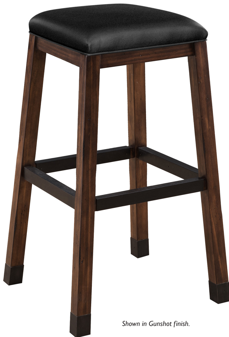
Shown in Gunshot finish.